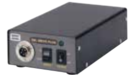
EBL Drive Plus