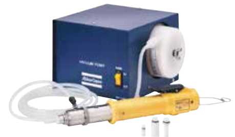
Vacuum pick-up system