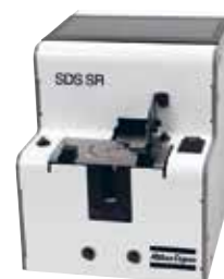
Screw dispenser for vacuum pick up