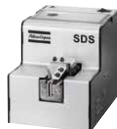
Screw dispenser for magnetic bit