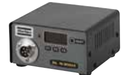
EBL RE module