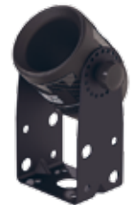
Tool holster small