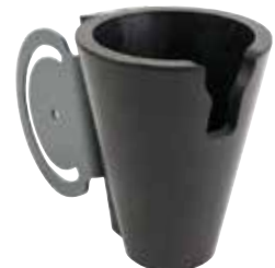
Tool holster large